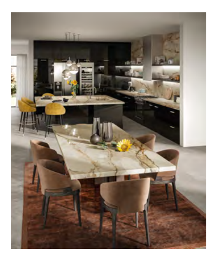
Calacatta Antique - Polished