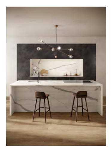
Statuario Supremo - Silk