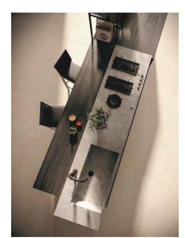
Grey Stone - Silk