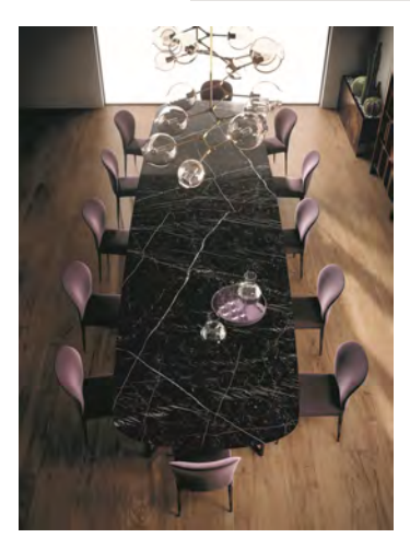
Nero Marquina - Silk