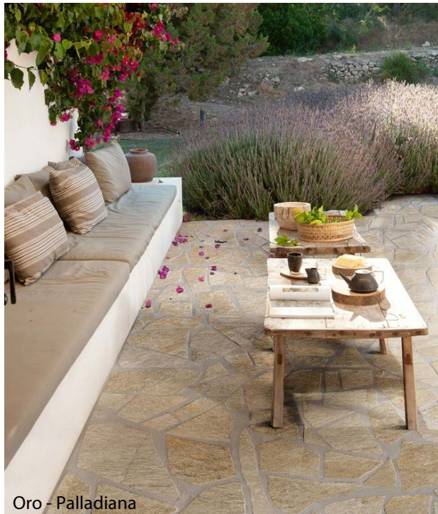
Oro - Palladiana

Applications: Commercial & residential in & out doors, including foyers, boutiques, galleries, living areas, balconies, patios, kitchens, bathrooms, floors, walls and step treads (with lamination and various edge detail finishes being achieved).