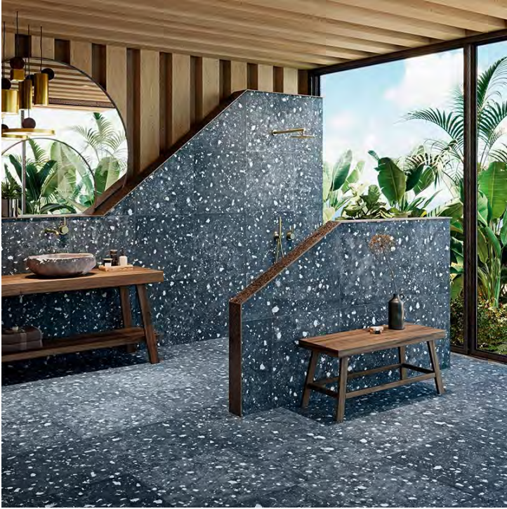
Blue floor & walls